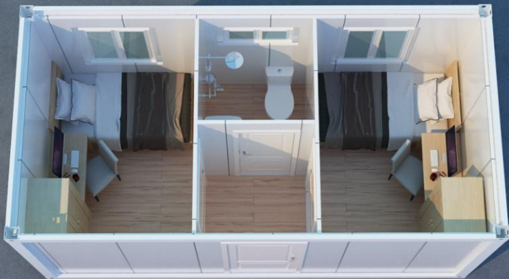
Two People Bedroom