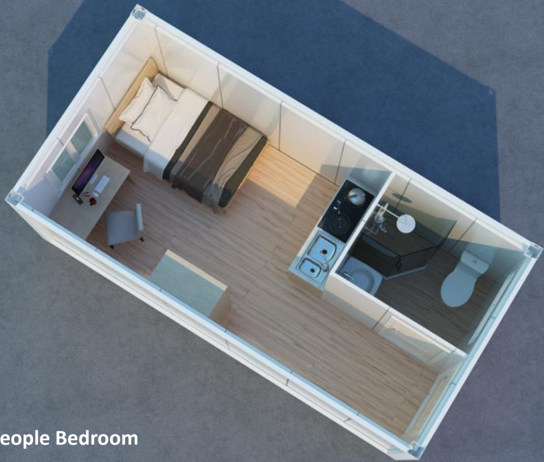
One People Bedroom