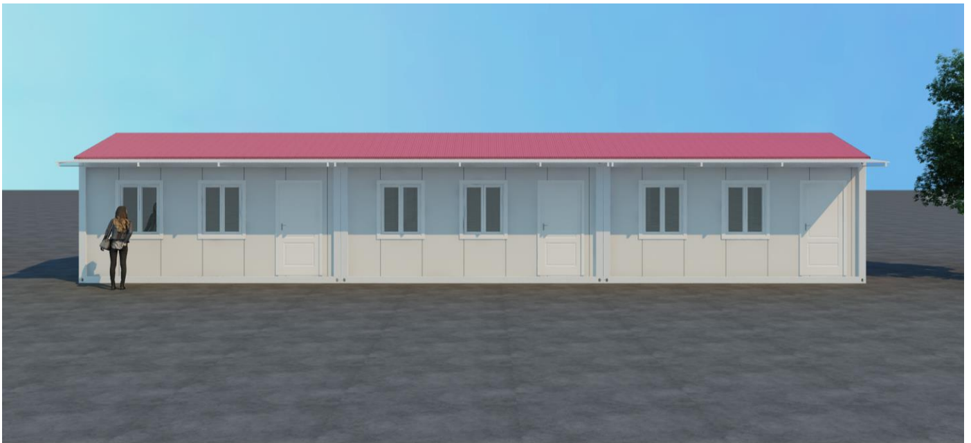
Container Clinic Exterior Show