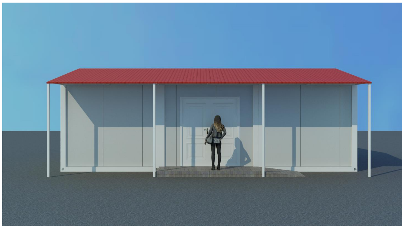
Living Container House Exterior Show